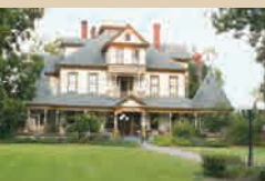
The Coleman House – A picturesque Victorian era mansion