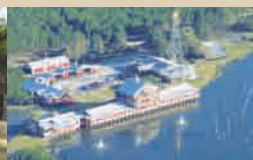
Flat Creek Lodge – unforgettable hunting and fishing for the discerning sportsman