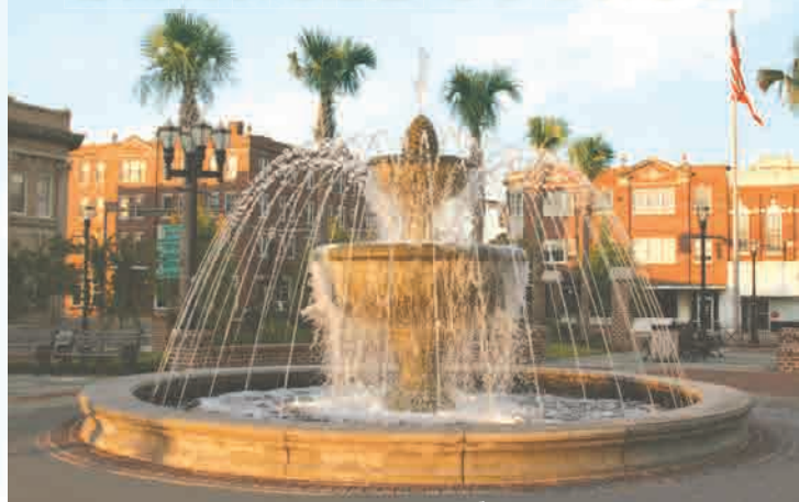
Swainsboro Downtown Square

In the heart of the fastest growing region in the Southeast, Swainsboro and Emanuel County is located in the center of a triangle of Augusta, Savannah and Macon.