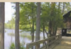
George L. Smith State Park – Serene natural beauty, a 1880's covered bridge with dam and grist mill