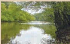
Enjoy the scenic beauty of the Ogeechee and Ochopee Rivers