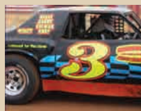
Swainsboro Raceway – "the south's finest and fastest dirt track"

In the heart of the fastest growing region in the Southeast, Swainsboro and Emanuel County is located in the center of a triangle of Augusta, Savannah and Macon.