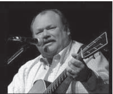
THE IAMES KING BAND (Friday, 1st)